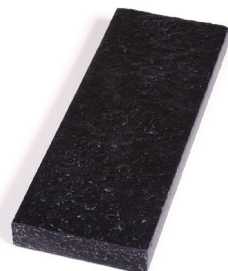
Emcrete expansion joint patching and nosing material

Non-Hazardous High-Impact Elastomeric Concrete Material