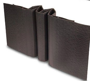
BG-0400 shown in positive side wall orientation.