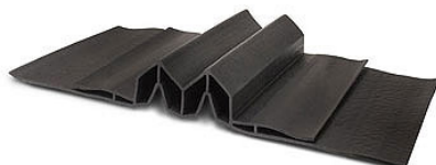
BG-0400 shown in underslab orientation