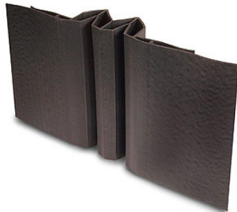
BG-0400-P shown in positive side wall orientation.