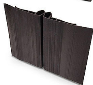
BG-0200 shown in positive side wall orientation.