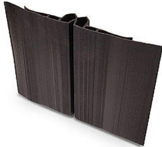
BG-0200-P shown in positive side wall orientation.