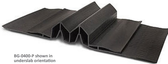
BG-0400-P shown in underslab orientation