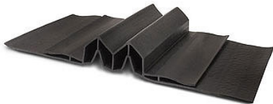
BG-0400-P shown in underslab orientation