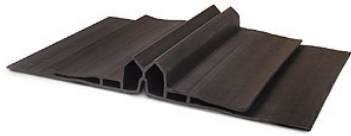
BG-0200-P shown in underslab orientation