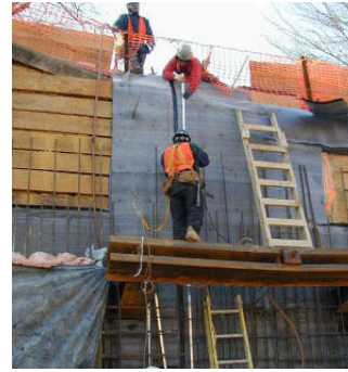
BG SYSTEM fully integrated into waterproofing membrane and installed onto lagged wall.

Where the structural joint extends through the foundation slab, the waterproofing membrane is installed on the ground over the mud-slab, compacted fill or gravel as prescribed by the designer or waterproofing membrane manufacturer, as well as onto the lagged walls in accordance with the waterproofing membrane manufacturer's instructions.