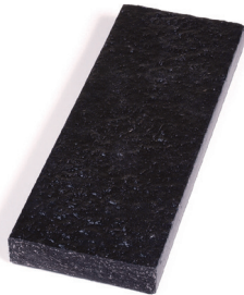
Emcrete expansion joint patching and nosing material

High-Impact Elastomeric Concrete Material