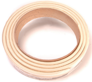
Colorseal-On-A-Reel provides a 10-ft (3m) length on a single reel.

Silicone-coated, precompressed, primary seal for rapid installation into small joints in vertical and horizontal planes.