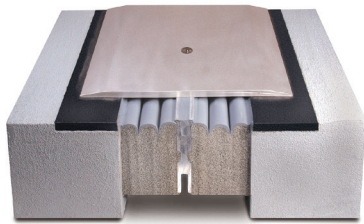
Pictured with optional elastomeric nosing

Watertight, Seismic and Large-Gap Deck Expansion Joint System for Decks — Parking, Stadium Concourses, Treads & Risers, etc.