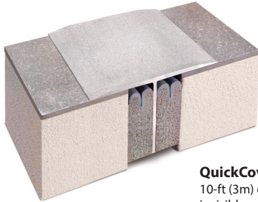
QuickCover 10-ft (3m) of rapid install, invisibly anchored, floor and wall coverplate

Precompressed, anchorless, rapid installation floor expansion joint cover.